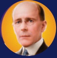
Rtn. Paul Harris FOUNDER OF ROTARY